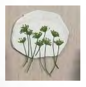
7. Use the Bent Tip Tweezers to pick out the remainder of the plant material.